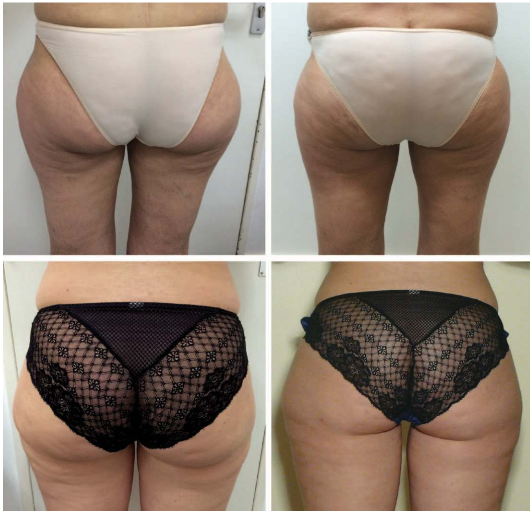
Fig. 4. Photographs of patients with saddlebags at day 0 (left) and at 6 months (right).

The patient satisfaction questionnaire completed at the end of the study showed that the majority of patients were satisfied with the results of the procedure, with 47 patients (89.58 percent) stating that they would recommend cryolipolysis for treatment of saddlebags to their friends (Table 2). Of the 48 patients, 44 (83.33 percent) underwent a further cryolipolysis session on another body area.