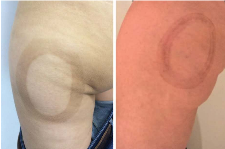
Fig. 5. Two examples of cryolipolysis-induced hyperpigmentation. The photographs were taken 15 days after treatment.