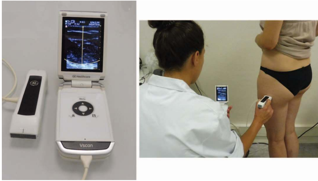
Fig. 2. Measurement of subcutaneous fat thickness with ultrasound. The measurement was performed with the ultrasound probe held perpendicular to the skin surface; the measurement was obtained at the point where the subcutaneous fat layer was thickest.