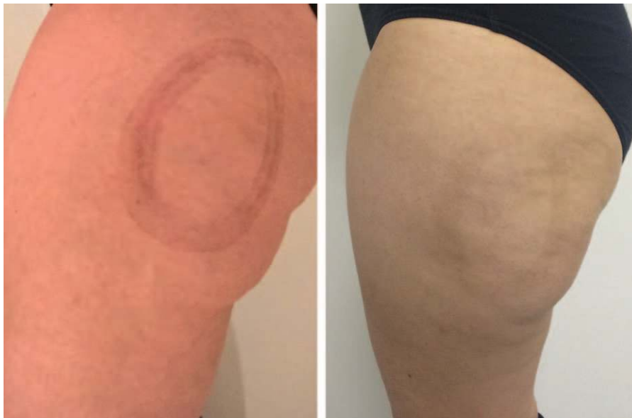
Fig. 6. Progressive decrease in hyperpigmentation after cryolipolysis: 2 weeks after treatment ( left ) and 6 months after treatment ( right ).