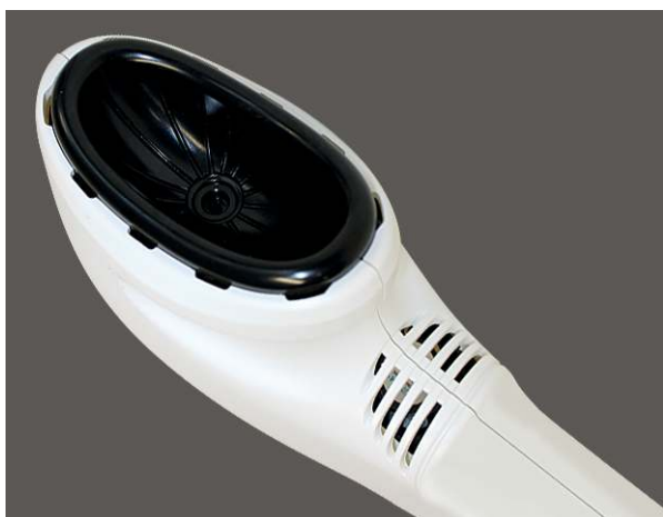
Fig. 1. Handpiece

Cryolipolysis was performed using CryoSlim (BFP Electronique, Montrodât, France) (Fig. 1). The same operator (A) performed the procedure in all patients. Each patient underwent one cryolipolysis session of 55 minutes at a temperature of -2^{\circ}\text{C} and a depression of -300 mbar centered on the saddlebags, followed by 5 minutes of energetic manual massage with kneading motions (this is the approach used in most aesthetic centers in France).